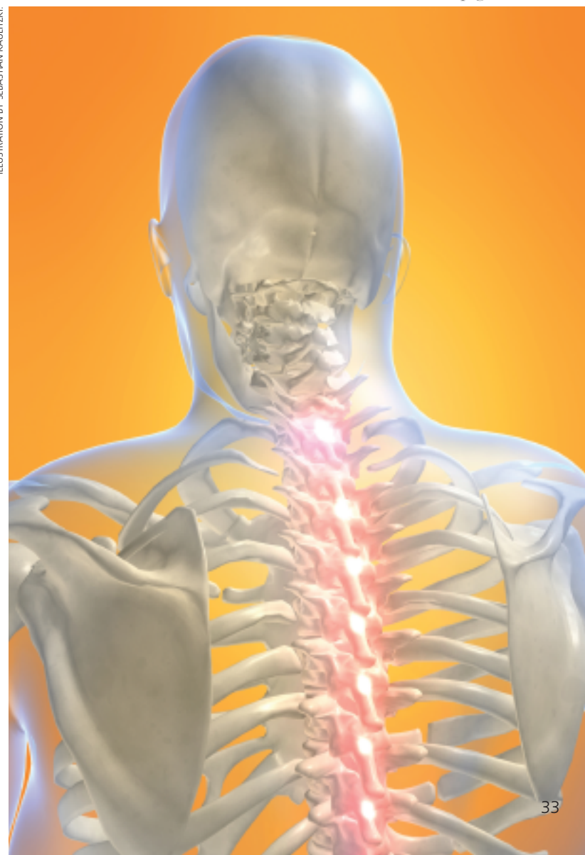
ILLUSTRATION BY SEBASTIAN KALUTZKI