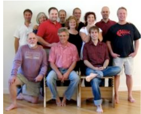
The Kinesis Advanced Training class

We have already set the schedule for next summer's program in Walpole, Maine: